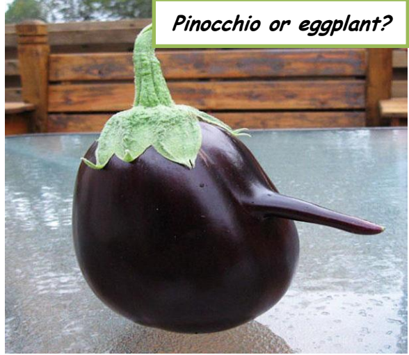
Pinocchio or eggplant?