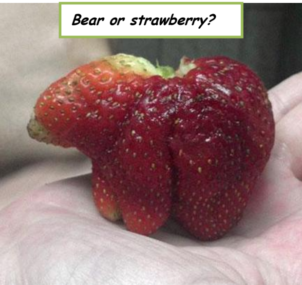
Bear or strawberry?