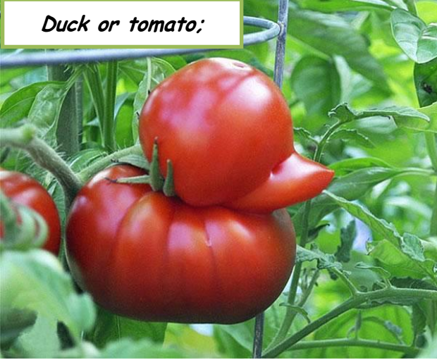
Duck or tomato;