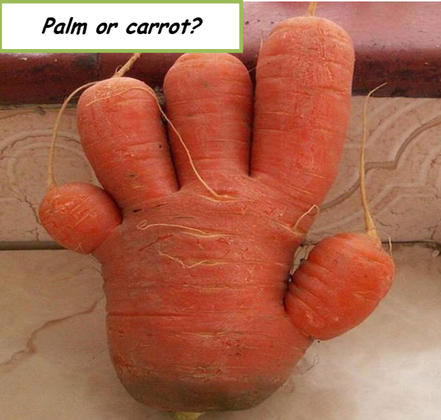
Palm or carrot?